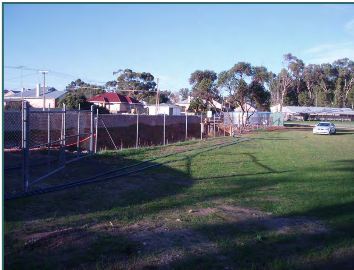
Minlaton West Stormwater collection area - opposite town oval