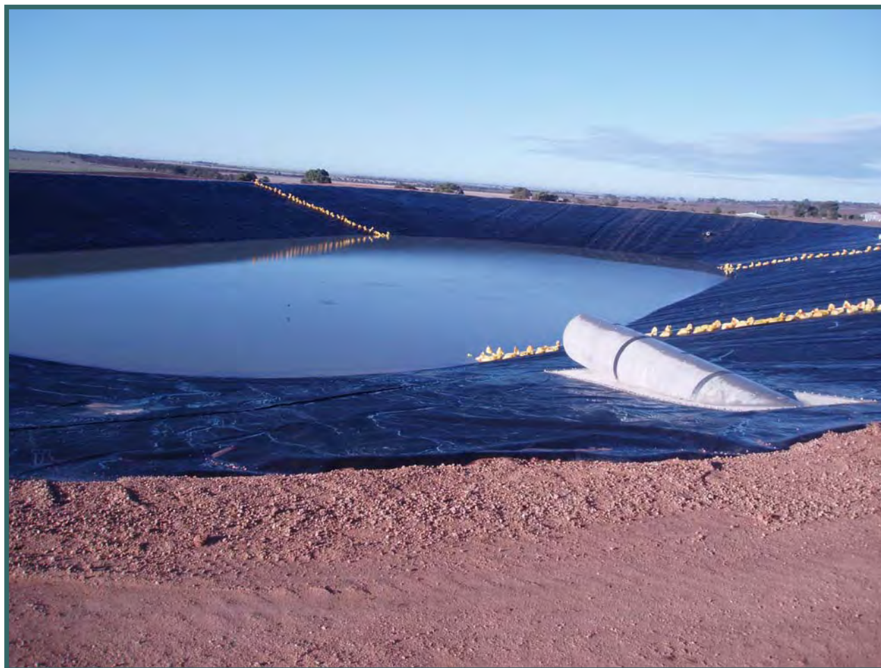
Recently constructed 19 megalitre dam – Maitland East