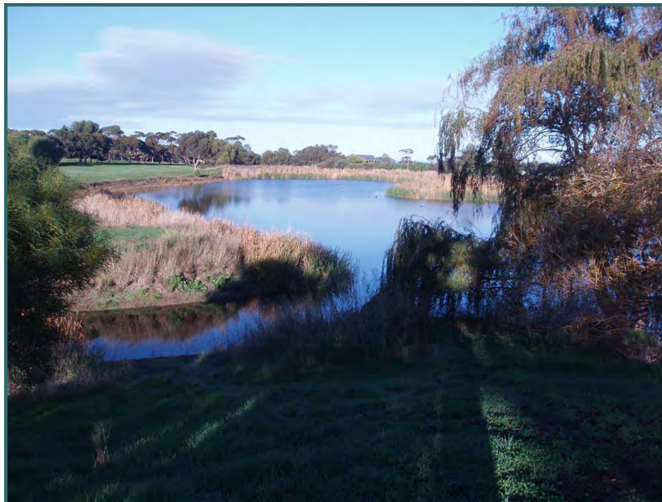
Stormwater retention dam – Maitland West