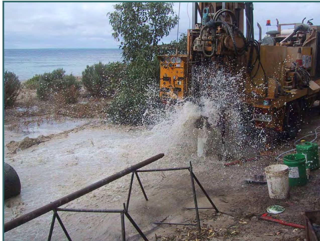
Drilling the Beach Well at Marion Bay